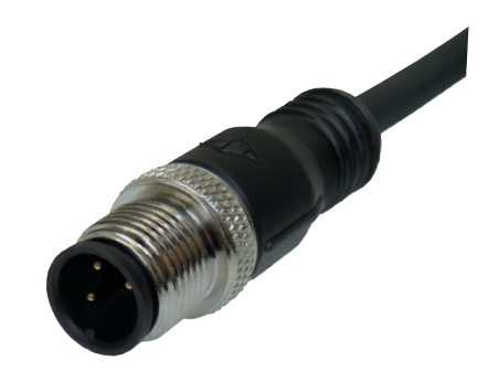
Male 3-Pin version shown above

Canfield Connector is known for its robust connections with an American twist, and the CANFAST® brand of M12 electrical connectors are no exception. This family of robust, all molded anti-vibration electrical connectors for sensors and actuators are specified by those needing a sure connection to valves, sensors, or automation of all types. Available in all industry styles including shielded and unshielded, and in various wire lengths. The CANFAST® round connectors are made in the USA to strict quality standards and are ready for fast delivery.